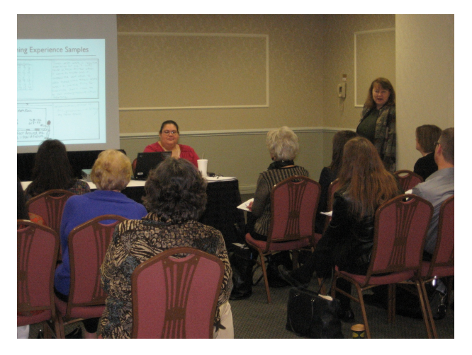
Full attendance at presentations