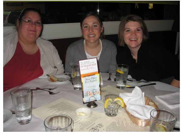
New faces at RCML—doctoral students!