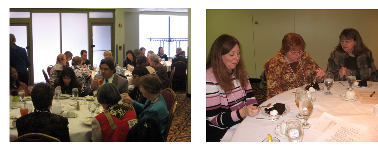
Fantastic food, great conversations and yummy desserts!